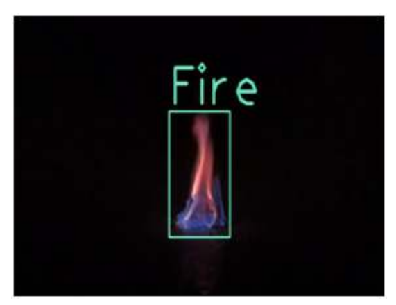
Figure 5: Video Frame with Fire Predictions.

From the Fire Net dataset, we select 300 images with fire and without it to test our model's fire recognition ability. The layout of the model will be shown below. Figure 7 shows some cases of fire recording using the proposed model