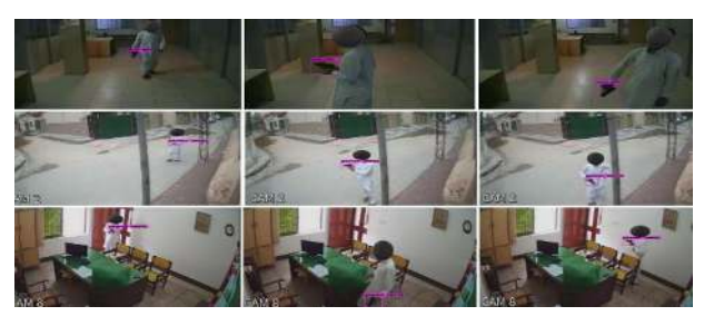
Figure 6: Cumulative Result of Detecting Weapon with Precision Value.

A practice dataset was created because there was no data for weapon frames, as indicated by the CCTV view. As result, 20 guns images have been accumulated from various locations, of which are CCTV images of individuals with guns.